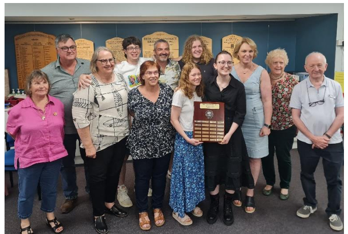
Brisbane Zone Winners: QCBC Team

The Redland Bridge Club Teams were very credible second placegetters, with the Kenmore Bridge Club in third place.