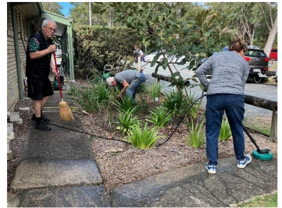
Cleaning the paths