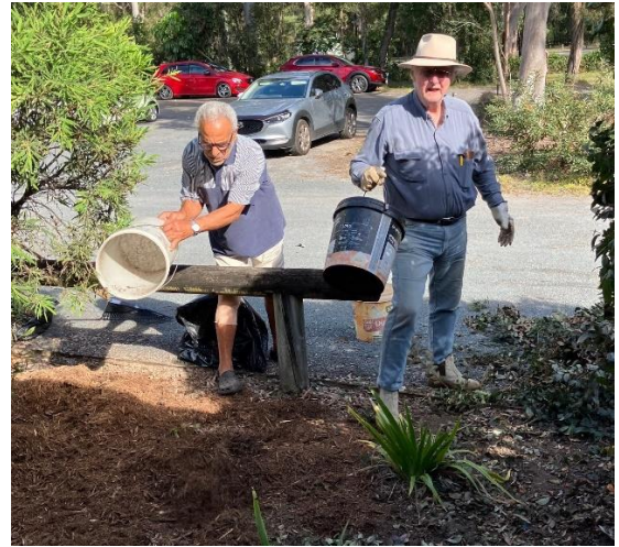
Spreading the mulch

Everyone's hard work has paid off, with the gardens and surrounds now looking refreshed and tidy.