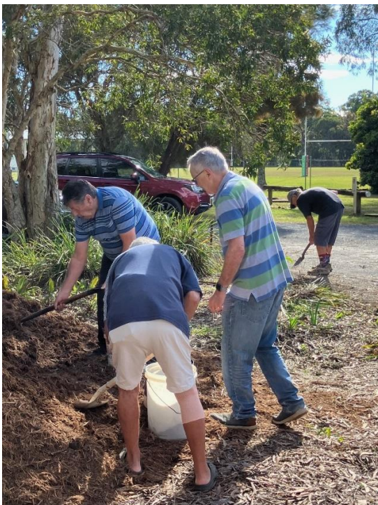
Moving the mulch