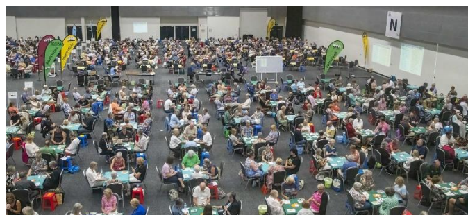
A small section of the Restricted Pairs in action